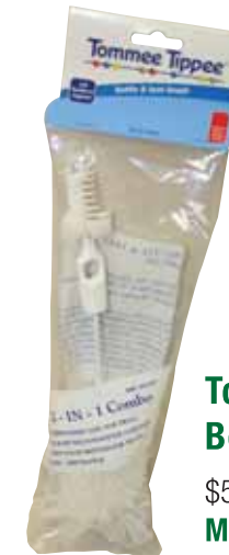
Tommee Tippee Bottle Brush $5.95 Members $4.75