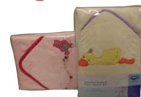
Playgro Hooded Towels $12.00ea Members $9.60ea