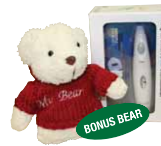
Microlife Ear Thermometer $66.00 Members $52.80