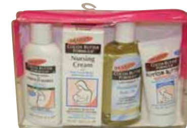
Palmer's Mother/Baby Travel Set $9.95 Members $7.95