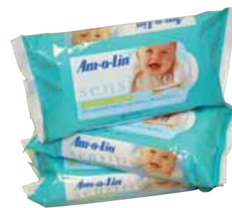
Amolin Baby Wipes $4.95ea Members $3.95ea