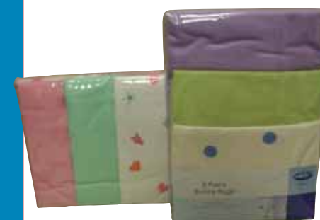
Playgro 3 Pack Bunny Rugs $12.00ea Members $9.60ea