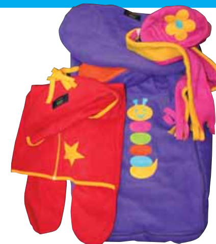
Pram Bag $50.00 Members $40.00