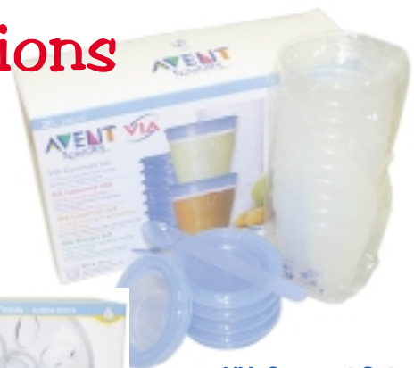
VIA Gourmet Set